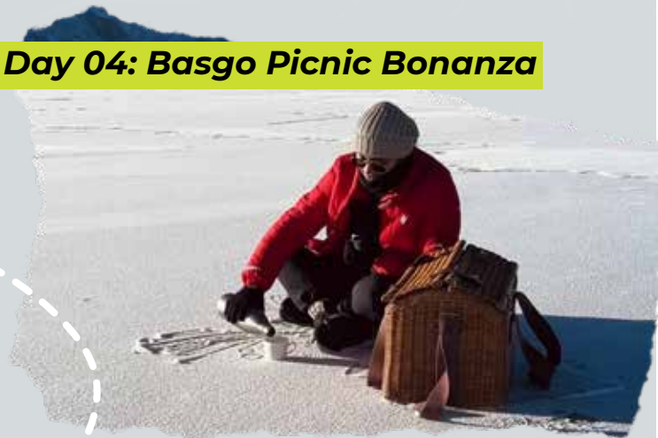
Day 04: Basgo Picnic Bonanza