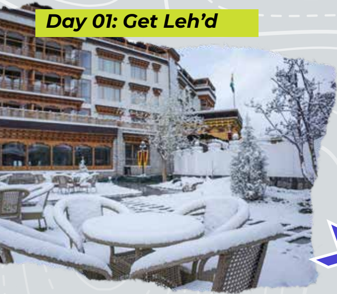
Day 01: Get Leh'd