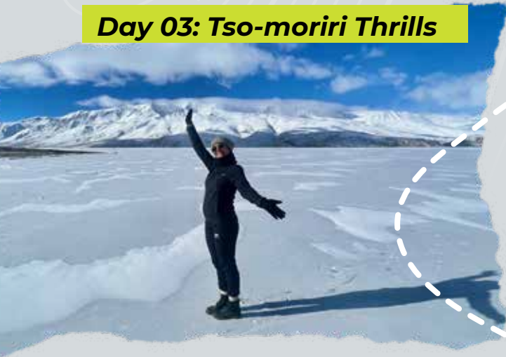
Day 03: Tso-moriri Thrills