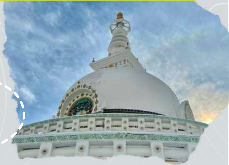
Day 02: Sunrise Shenanigans in Leh