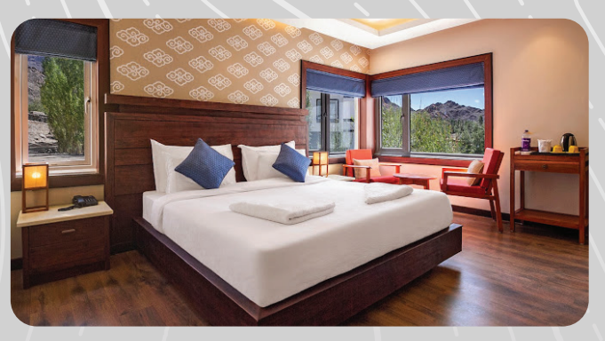
Nubra: Organic Retreat Nubra