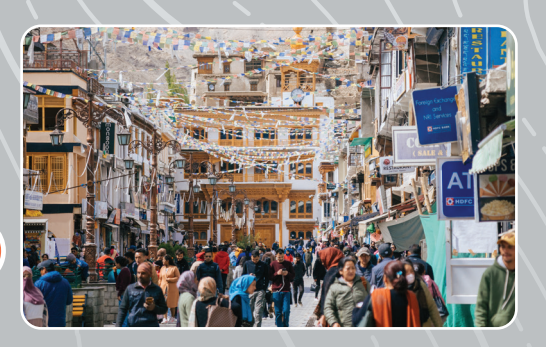
Day 04: Nubra Valley Visit the Siachen Base Camp